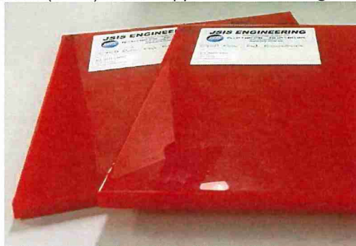
Fig. 5: Tested sample pieces