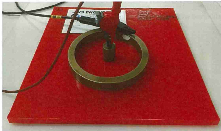
Fig. 4: Sample piece under test

Any variation from Standard/Test Method: None.