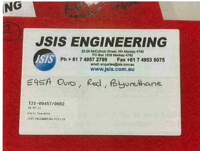
Fig.1: Sample material